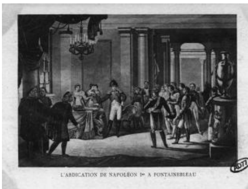
Gravure abdication de Napoléon Ier, 2Fi02510

At the end of 1813, the Allied coalition won several victories against France and, when Paris fell in the early spring of 1814, "it was the beginning of the end", to use Talleyrand's famous phrase.