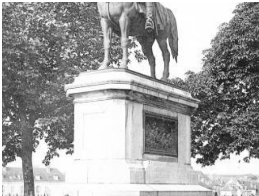
Equestrian statue of Napoleon I in Montereau, photograph, 2fi05772

Between December 1813 and April 1814, the 6th coalition, formed by Great Britain, Russia, Prussia, some German states of the Confederation of the Rhine and Austria, led a campaign in France against the Napoleonic Empire. The coalition's plan was the following: the Army of Bohemia, led by Prince Charles-Philippe of Schwarzenberg, would march against Napoleon to allow the Army of Silesia, led by Prince Gebhard Leberecht von Blücher, to take Paris.